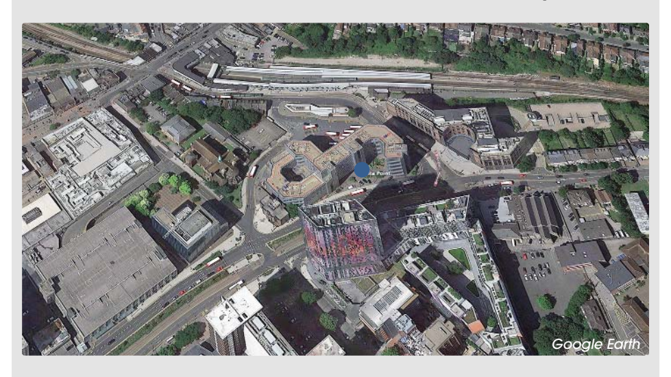
Case Study 3 Lost revenues for infrastructure and services – Delta Point, Croydon

A prior notification was received by Croydon Council to convert a former office building, Delta Point, into 404 residential units (location denoted by the red dot in the satellite image above). Despite being a very dense development, no amenity space was provided, and only 100 units met national space standards.